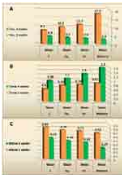
Figure (3): Mean values of TN, TA and MA in the studied groups at 2 and 4 weeks.